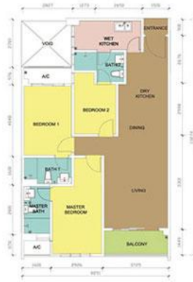
TYPE B 1097 sq.ft.