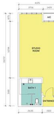
TYPE D 456 sq.ft.