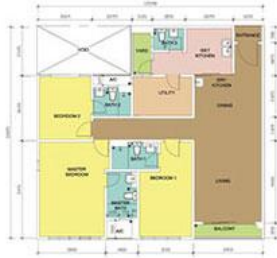
TYPE A 1449 sq.ft.