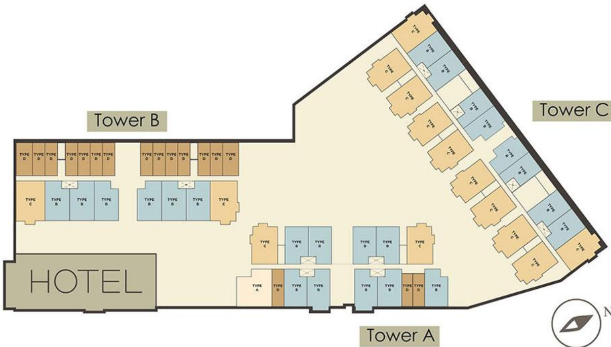
Type A Type B Type C Type D